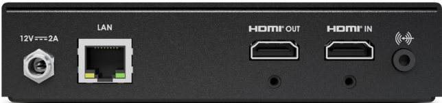
Maevox 7112A (AVC), back view

Maevox 7112H features a similar form factor to 7112A