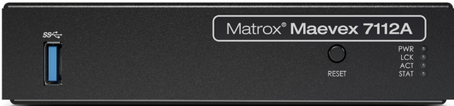
Maevox 7112A (AVC), front view